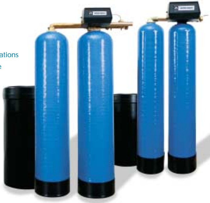
Above photo shows the 1" and 1.5" ATW-Series Systems